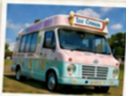
ICE CREAM VANS